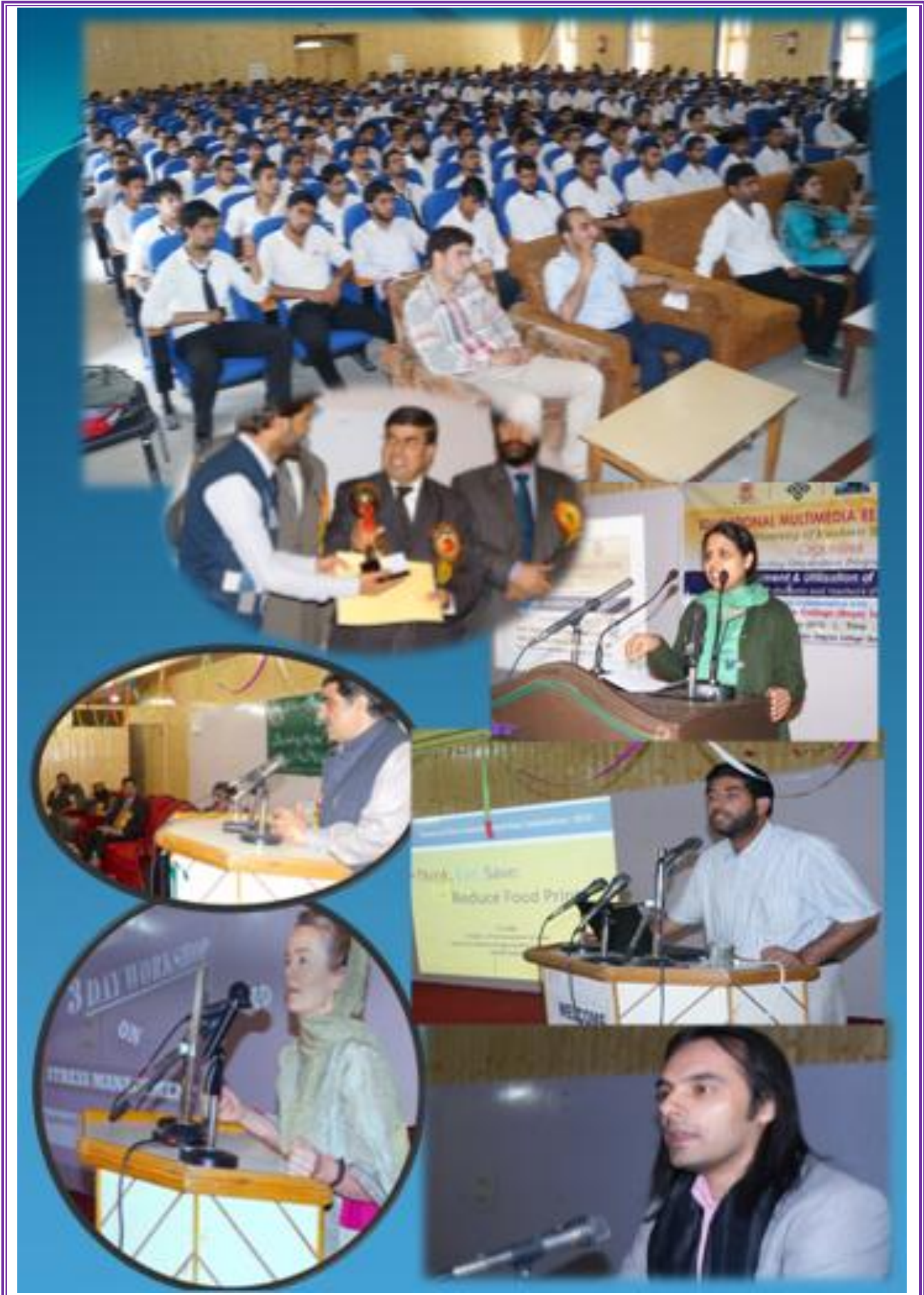
Annual Quality Assurance Report (AQAR) of the IQAC-2013-14