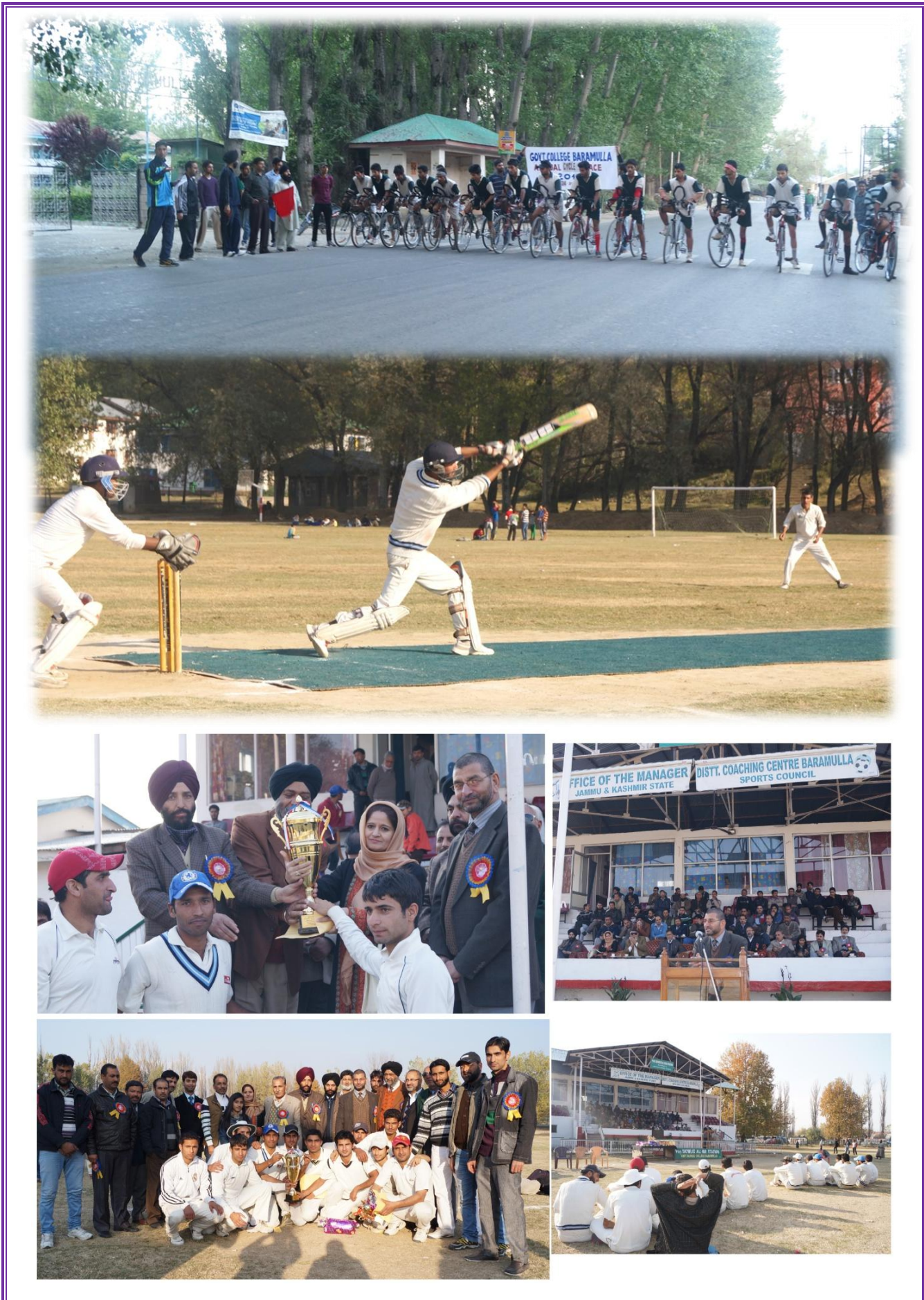
Annual Quality Assurance Report (AQAR) of the IQAC-2013-14