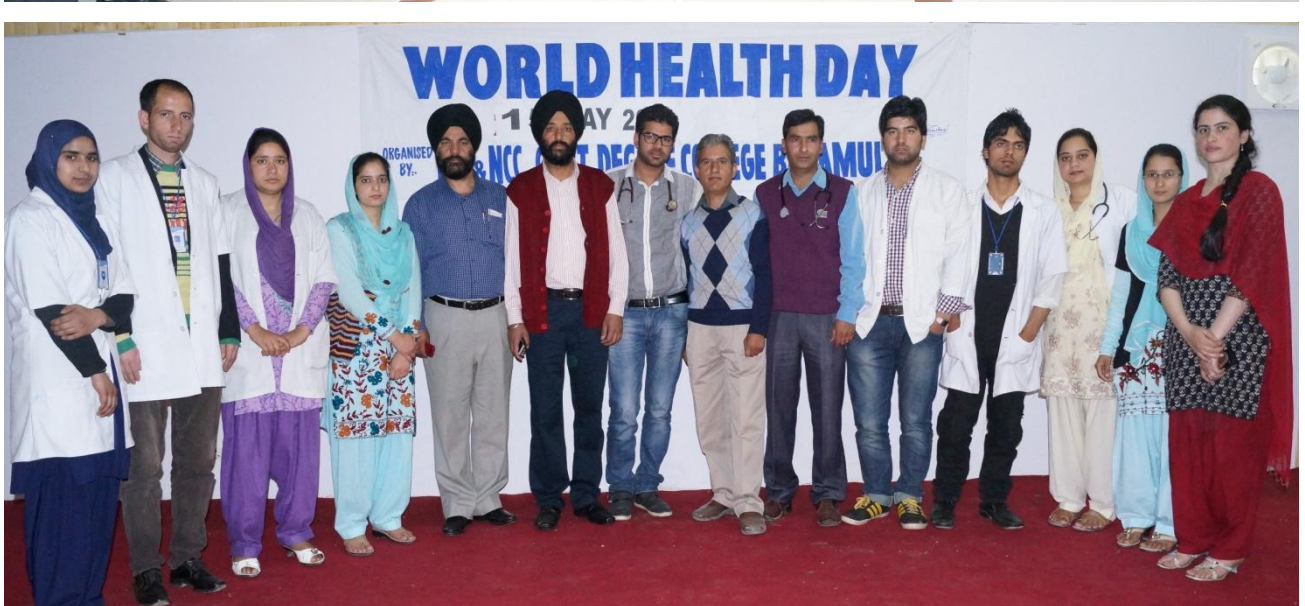
Annual Quality Assurance Report (AQAR) of the IQAC-2013-14